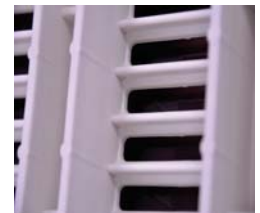
T-Shape Semi - Tapered Slats

GSI AP Nursery Slat interlock on all four sides to insure that panels stay in place.