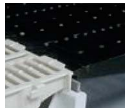
Raised or Flat

GSI AP Nursery Slat panels provides better udder presentation and piglet safety.