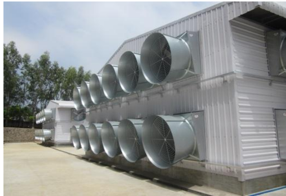
52"3 Blade Belt Drive Fan